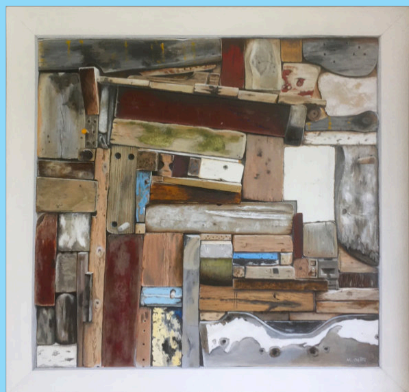
Wood Sculpture Collected material