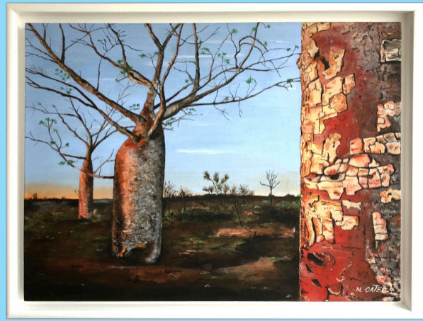
Baob Trees Acrylic

For 20 years I ran my own business designing gardens, and this artistic trait comes through in many of my pictures, which often feature various landscapes. I also like working with abstract designs, which gives me more freedom of expression.