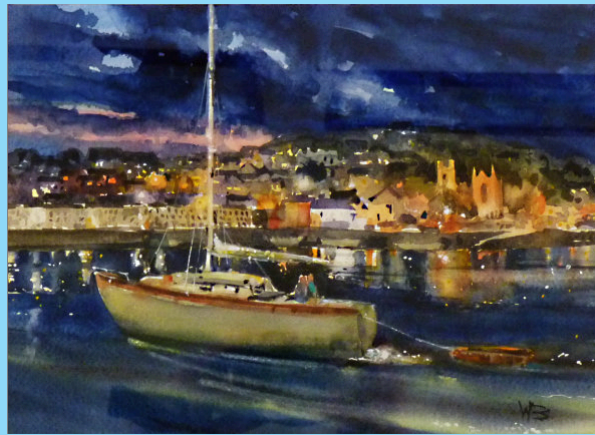
Evening Return - Appledore Watercolour