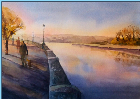
Early Morning - Taw Vale Watercolour