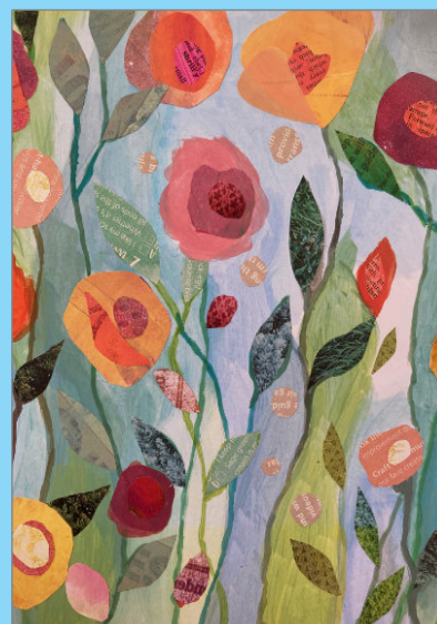
Happy to see you Paper Collage