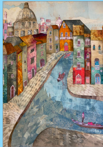
The Magic of Venice Paper Collage