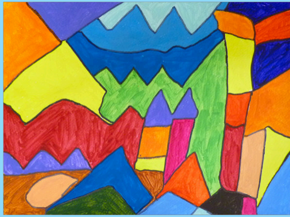
The play of Light 16.5in x 11.75in Pen and line with watercolour

At present I am exploring areas of colour and their relationship to the colours around them. I fill areas with vibrant colours, often containing them within a black line framework. Some people have commented that my pictures remind them of stained glass panels.