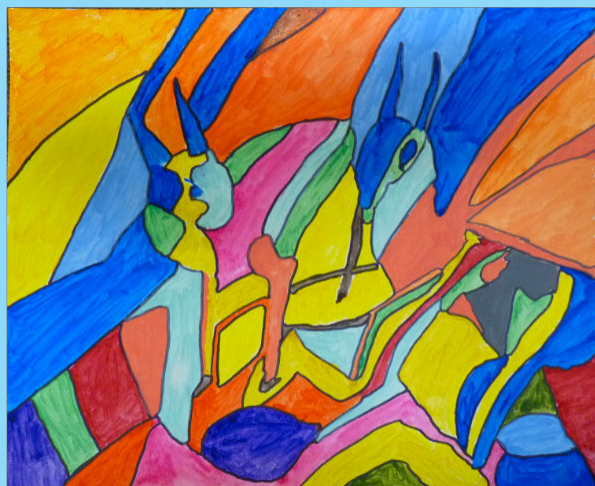
Flowing Rhythm 18in x 11.75in Pen and line with watercolour